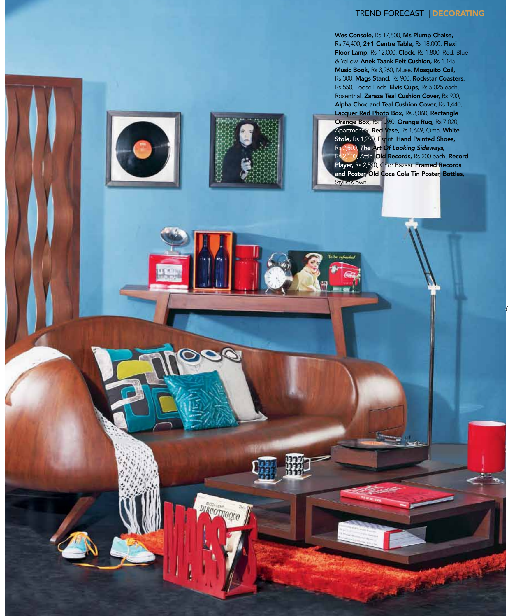
LOCATION COURTESY RED, BLUE & YELLOW; MUMBAI

Wes Console, Rs 17,800, Ms Plump Chaise, Rs 74,400, 2+1 Centre Table, Rs 18,000, Flexi Floor Lamp, Rs 12,000, Clock, Rs 1,800, Red, Blue & Yellow. Anek Taank Felt Cushion, Rs 1,145, Music Book, Rs 3,960, Muse. Mosquito Coil, Rs 300, Mags Stand, Rs 900, Rockstar Coasters, Rs 550, Loose Ends. Elvis Cups, Rs 5,025 each, Rosenthal. Zaraza Teal Cushion Cover, Rs 900, Alpha Choc and Teal Cushion Cover, Rs 1,440, Lacquer Red Photo Box, Rs 3,060, Rectangle Orange Box, Rs 1,260, Orange Rug, Rs 7,020, Apartment 9. Red Vase, Rs 1,649, Oma. White Stole, Rs 1,299, Esprit. Hand Painted Shoes, Rs 2,500, The Art Of Looking Sideways, Rs 2,100, Attic. Old Records, Rs 200 each, Record Player, Rs 2,500, Chor Bazaar. Framed Records and Poster, Old Coca Cola Tin Poster, Bottles, Stylist's own.