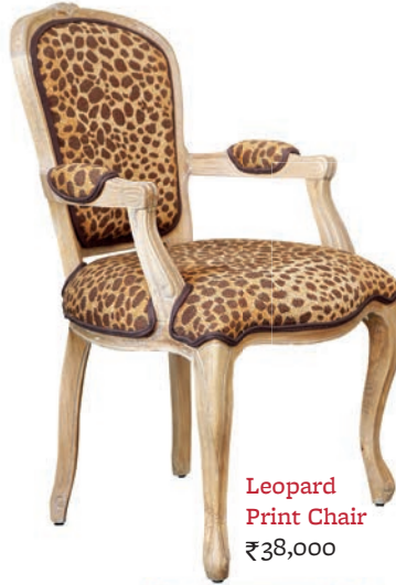
Leopard Print Chair ₹38,000