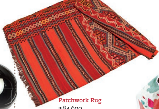
Patchwork Rug ₹84,600