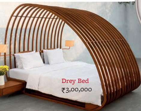
Drey Bed ₹3,00,000