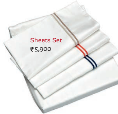
Sheets Set ₹5,900