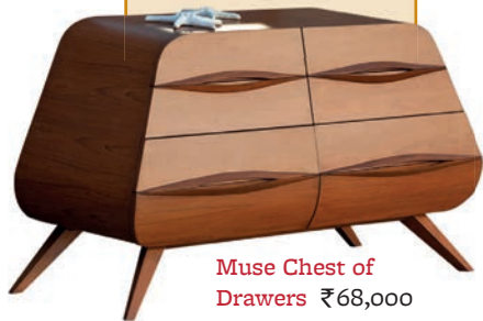
Muse Chest of Drawers ₹68,000