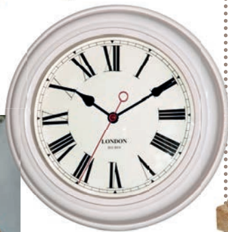
Wall Clock ₹6,400