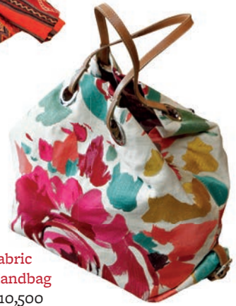
Fabric Handbag ₹10,500