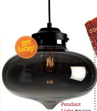
Pendant Light ₹7,500