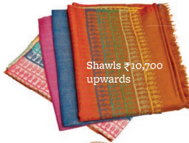
Shawls ₹10,700 upwards