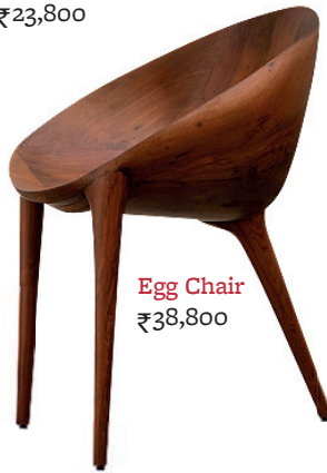
Egg Chair ₹38,800