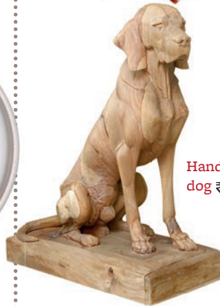
Handcrafted dog ₹55,000